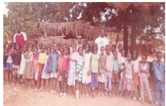
Children in a Primary school at Antula, in Bissau City – 2006. We ministered to them the good news of salvation and the love of God