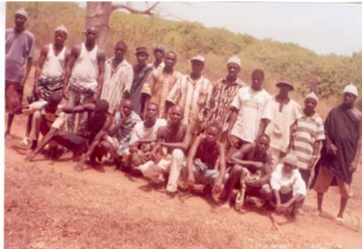
"Idol Worshippers" Cuntanga Village Elders standing on the parcel of land where the church, Christian school and clinic will be built.