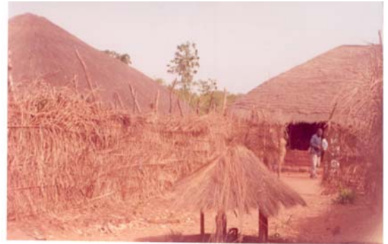
These are the houses of the family group. The hut in the center of the compound is where the family idol is kept