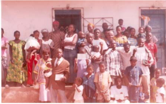
Members and trainees of the Church at Nhoma village