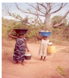
Below – Women coming from Cuntanga village carrying water fetched from the "hole."