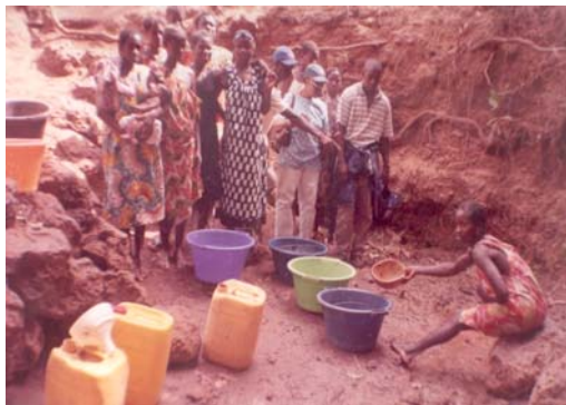
This is the only place where the villagers can fetch water