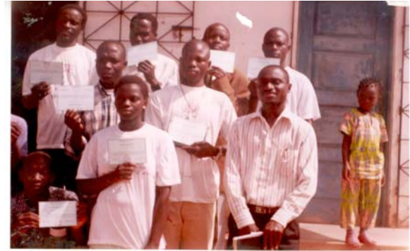
Children workers at Nhoma Seminar proudly showing off the certificates they received after training